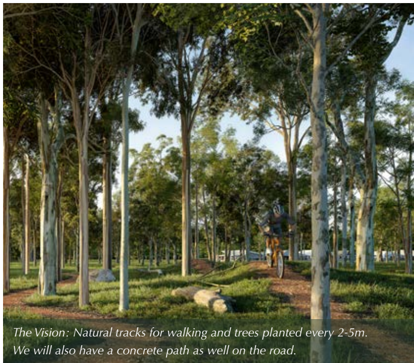
The Vision: Natural tracks for walking and trees planted every 2-5m. We will also have a concrete path as well on the road.